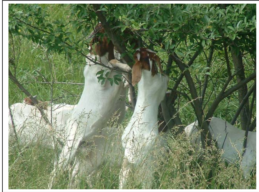
Figure 1. Goats browsing autumn olive shrub.