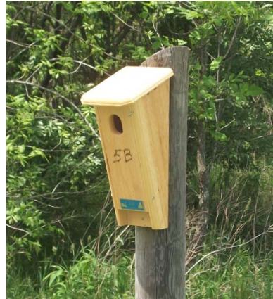
Figure 1. (a) traditional rectangular nesting box, and (b) the Peterson box.