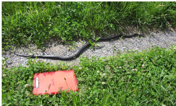
Figure 4. Black snake found along the road in field 2 one week after eggs disappeared from box 9A. The clipboard is 34.3 cm in length.

It is difficult to determine whether the Peterson boxes enhanced fecundity for any of the three species nesting along the trail, not only due to the low nesting activity in the Peterson boxes, but because of the numbers of eggs and chicks lost to predation. Five clutches (3 bluebird and 2 chickadee) were lost to predators. This was the highest number of nests lost to predators during the 6 years of study at the site. Two nests were lost during the 2011 season (Burkart et. al, 2011), 3 clutches during each of the 2009 and 2010 seasons (Burkart et. al., 2009, 2010), and 1 nest each during the 2007 and 2008 seasons (Burkart et. al., 2007, 2008). All 3 nests in field 2 were lost to predation. It is most likely that the bluebird nest in box 13A was most likely lost to a bear. The box was pulled open and the chicks were missing. The same thing happened to box 13A during the 2008 season, when a black bear was reported in the area (Burkart et. al., 2008). The clutches lost from boxes 9A and 12B in field 2 may have been lost to snakes. A week after the eggs went missing from box 9A, a large black snake was observed sunning on the path just down from the box (figure 4). Two clutches were lost in field 1, one from box 2A and one from box 6A. Nests in field 1 have experienced less predation over the years, most likely due to the electrified fence that surrounds the field and the height of the grass in most areas. Unlike field