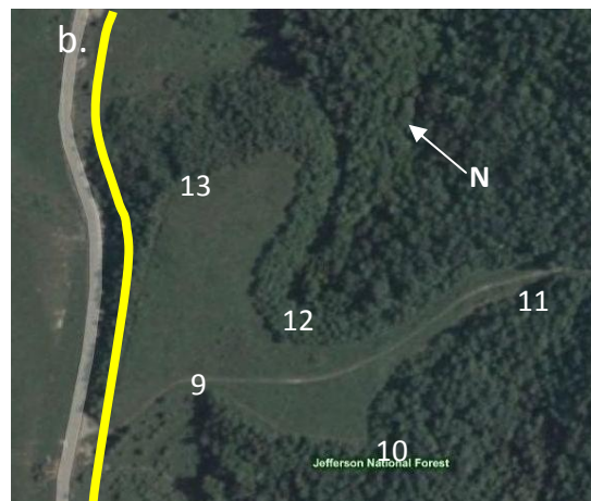
Figure 2. (a) Nesting box sites in field 1 and (b) field 2. Numbers indicate the box locations. Arrow indicates north. The B indicates the position of the barn. Yellow lines indicate the location of the main road.